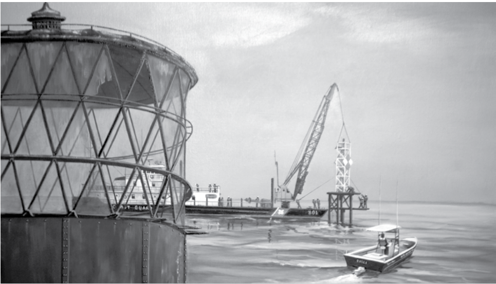
A painting from the Coast Guard art collection at the Clearwater Main Library

Email mfarley@clearwaterflorida.org or call (727) 461-0011 ext. 233.