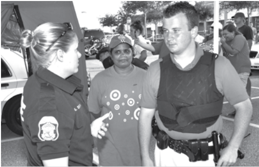
Citizens got to find out what it's like to be a police officer for a day.