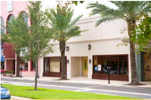
La Cacherie is still under construction but will open soon.

This is truly a gem in the crown of this city, and if it is any reflection of what is to come with the next two restaurants opening, Downtown Clearwater is bound to become