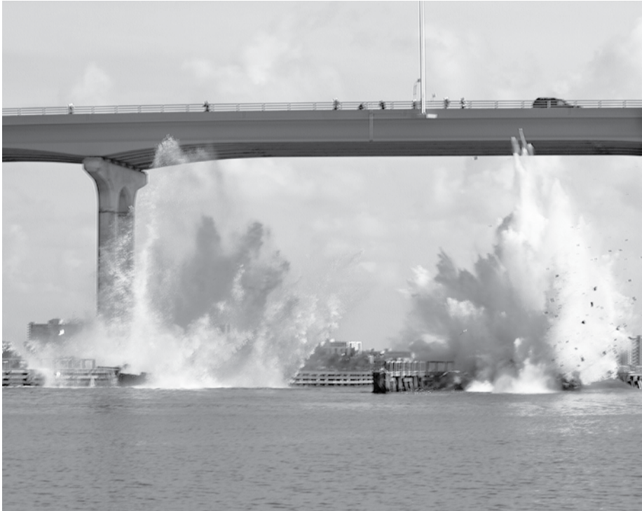
Demolition of a section of the old Belleair Bridge took place July 15th.

The Sunscreen Film Festival, now in its fifth year, will be hosting several educational seminars and film screenings throughout the year as it builds up to the festival in April. To find out more, please go to www.sunscreenfilmfestival.com .