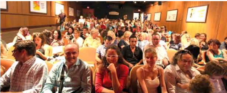
The audience enjoys the show.

Added to a great Broadway show, the play was interspersed with original skits about human rights.