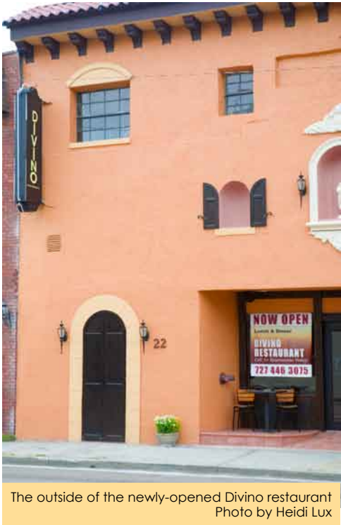
The outside of the newly-opened Divino restaurant