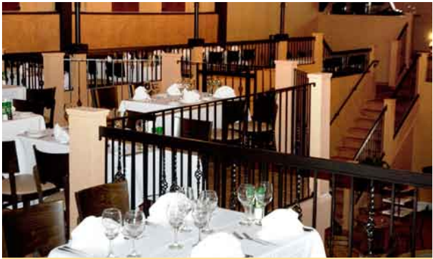
Divino's balcony seating

Even recalling the meal makes my mouth water. As we sat devouring our food we were approached by a modest waiter named Umberto who asked if he could sing for us. He sung a very poetic and beautiful song with the tenor voice of