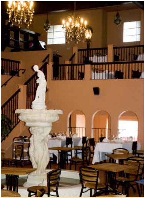
The fountain in Divino's piazza

Listen Live WEEKDAYS 11AM – 1PM EST ON TAN TALK 1340 AM