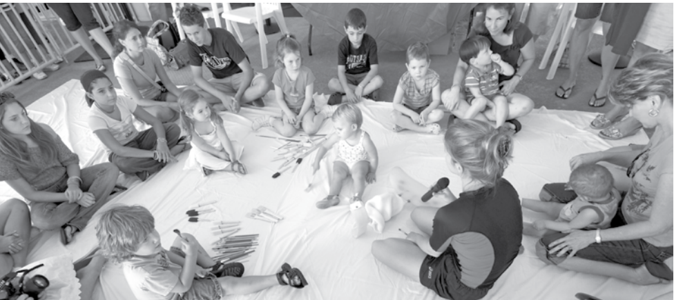
Kids from the Children’s Cancer Center paint their masterpieces

Undoubtedly, the children of the Children’s Cancer Center can look forward to more delightful outings to the Clearwater Marine Aquarium, perhaps even to interact again with CMA’s star, Winter, “The Dolphin That Could.”