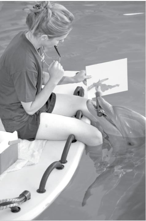
Winter the dolphin composing his artwork.