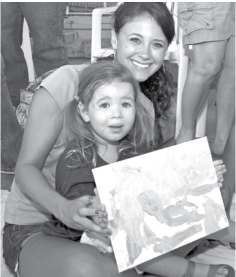
One of the many works of art crafted at the CMA