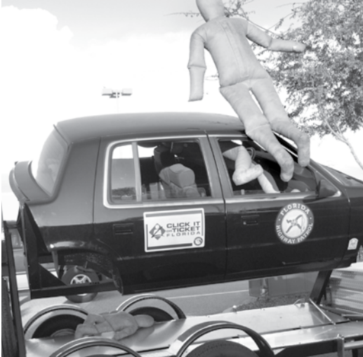
A dummy flies out of a car during an accident simulation

trained specialists with an emphasis on crowd control and disaster relief. The Clearwater ERT has the distinction of being the model ERT unit in Florida -- with the responsibility of training other ERT units throughout the state. One officer who described himself as “the gas guy” provided a glimpse into the world of ERT training. There are seven different types of gases available for use in riot control. During his training he was subjected to each of these chemical agents, including CS gas which attacks the mucous membranes. It takes a special type of person to be willing to be gassed every day for a week to serve the public good.