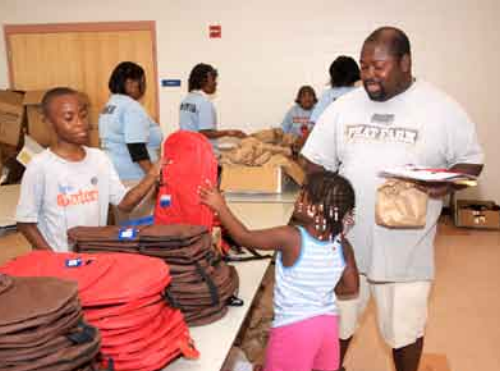
700 backpacks filled with school supplies were given to local kids