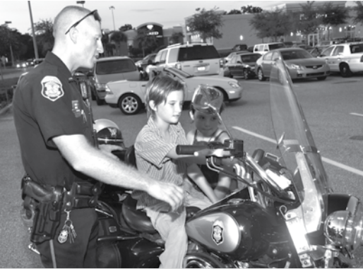
A Police Officer shows his motorcycle to local children