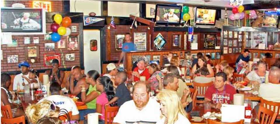
Customers enjoy the same great food at the newly named Abe's Mugs Grill & Bar