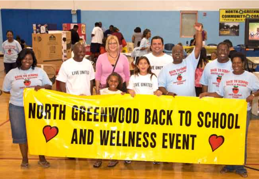
North Greenwood Back 2 School and Wellness Event Volunteers

The event originally began eight years ago. There were a few back to school events sponsored by non-profit organizations, but there was a lack of a major back to school event, so several organizations, including the Mt. Carmel Community Development Corporation of Clearwater came together to create a large back to school event.