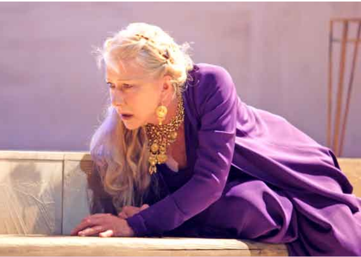
Helen Mirren in the title role of Phèdre